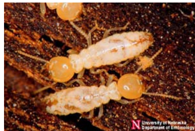
Subterranean termite workers