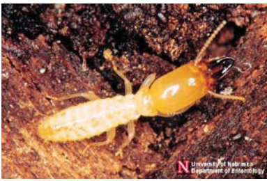
Subterranean termite soldier