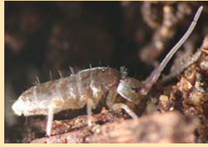
Springtails are commonly found in moist or damp places.