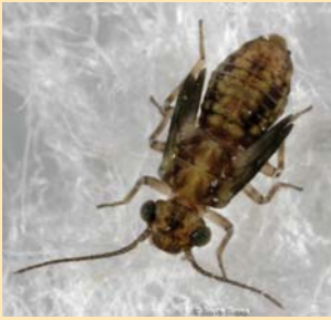
Plaster beetles are small reddish or black beetles found flying in homes during spring and summer.